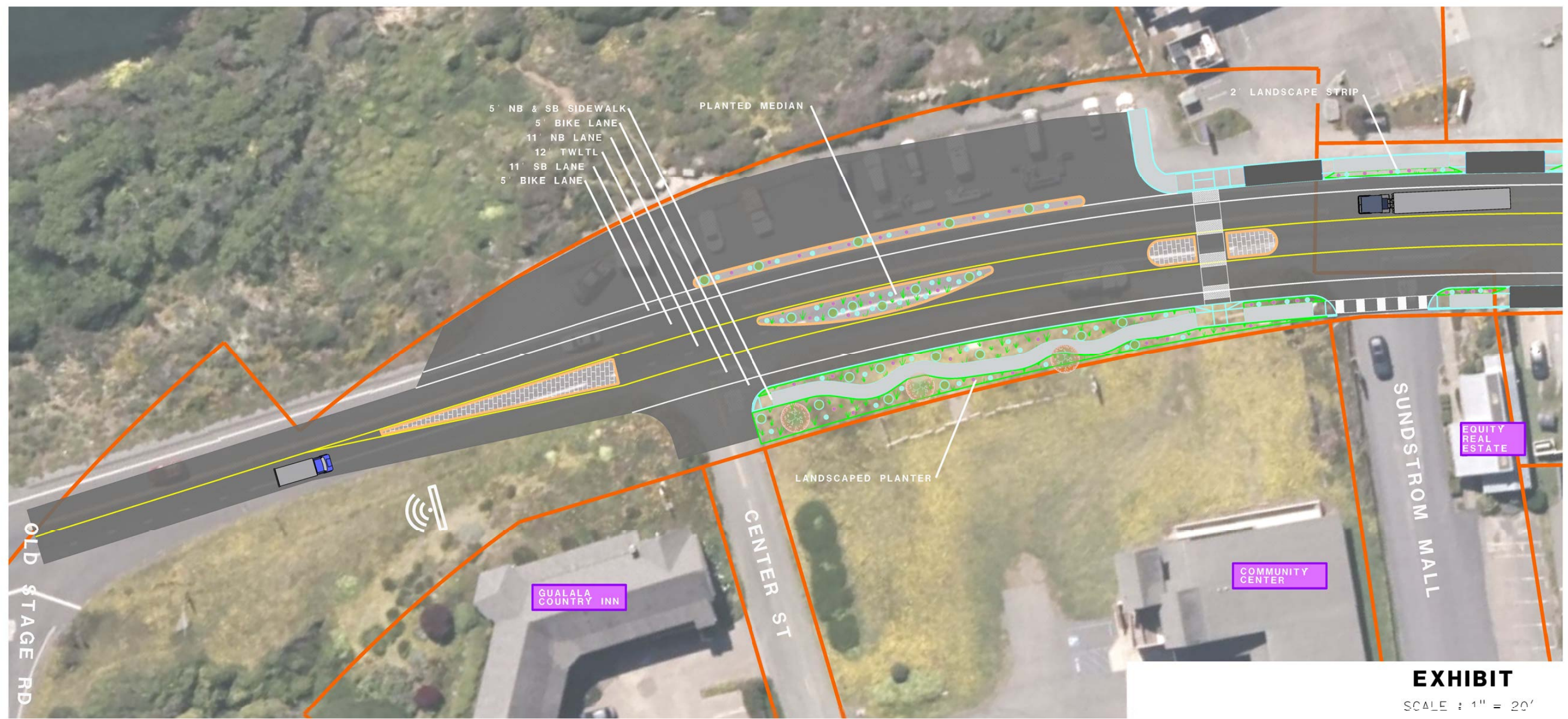
EXHIBIT SCALE : 1" = 20'