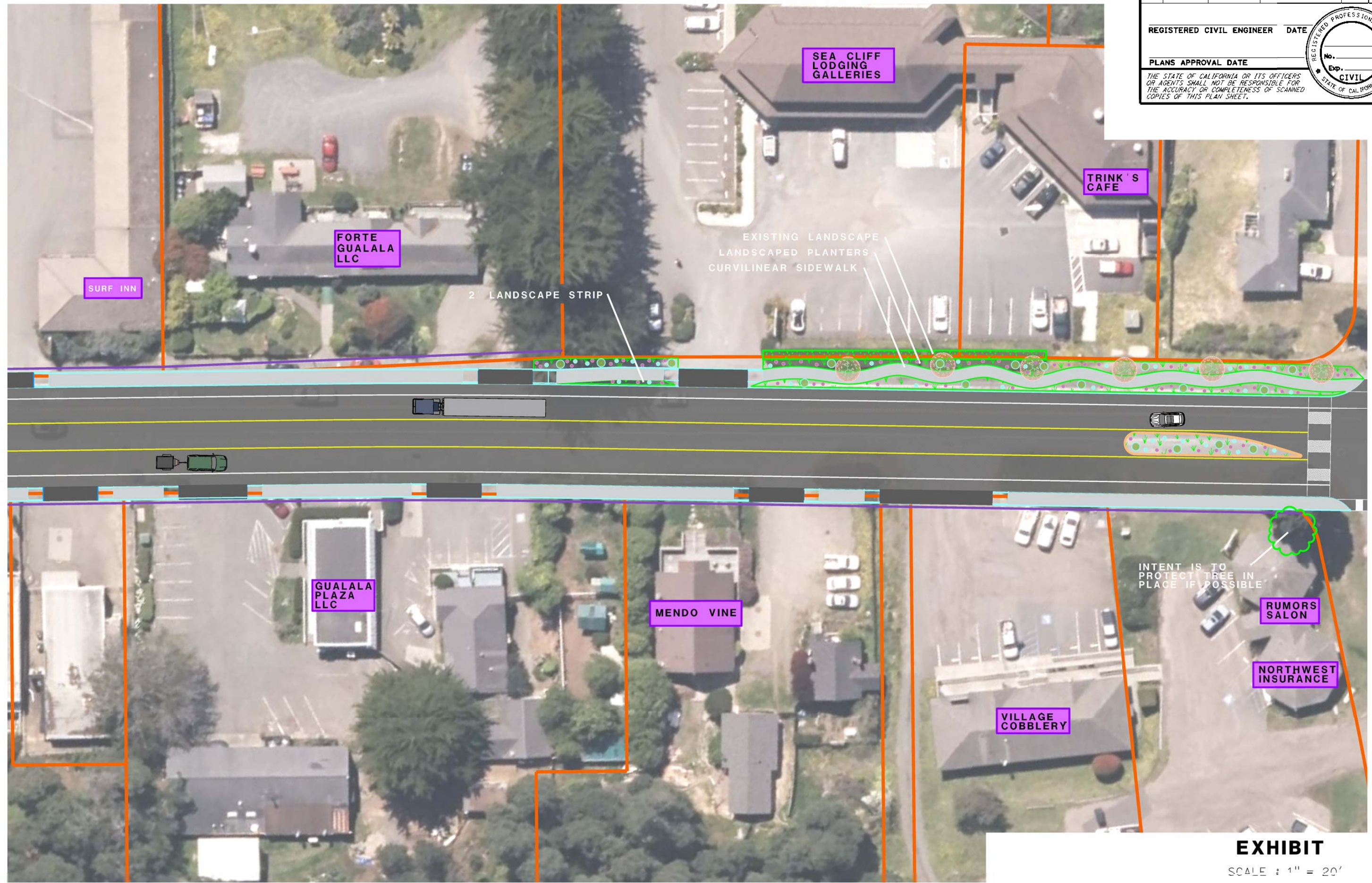
EXHIBIT SCALE : 1" = 20'

DATE PLOTTED => 4-APR-2023 TIME PLOTTED => 13:14