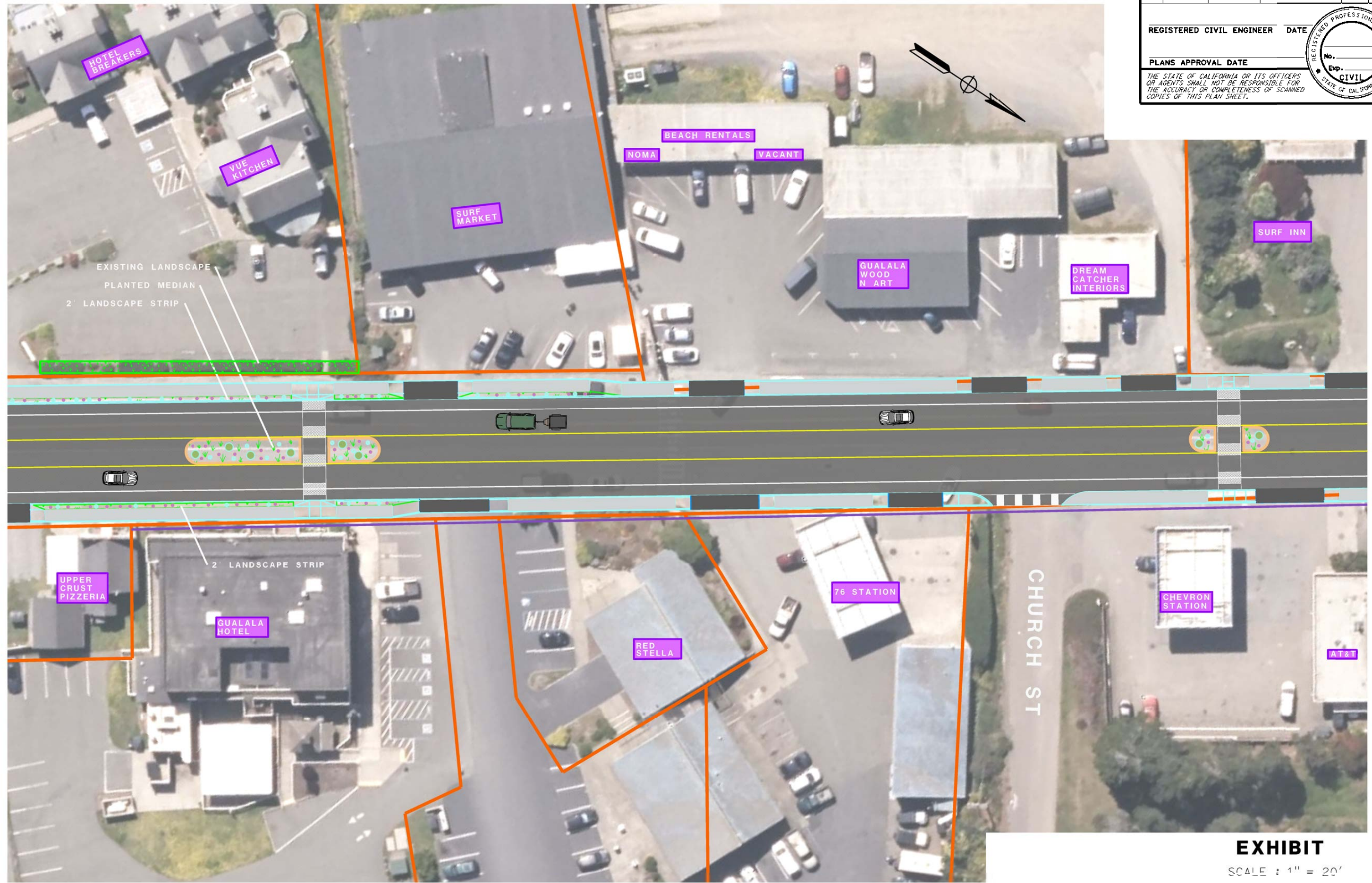
EXHIBIT SCALE : 1" = 20'

DATE PLOTTED => 4-APR-2023 TIME PLOTTED => 13:13